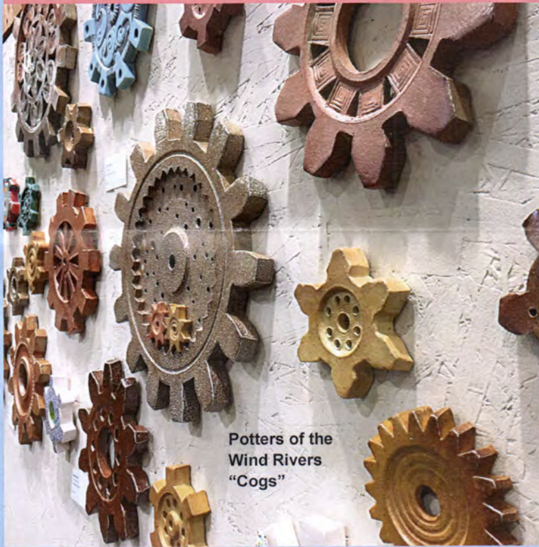
Potters of the Wind Rivers "Cogs"