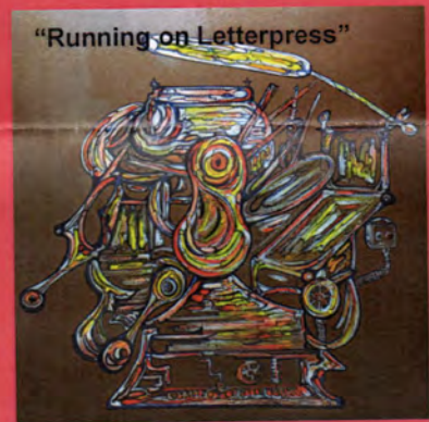
"Running on Letterpress"