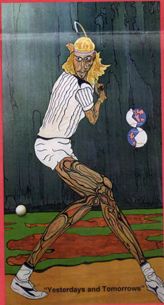
"Yesterdays and Tomorrows"